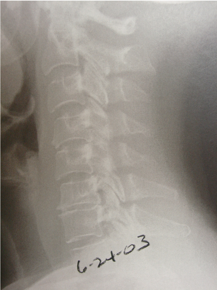
Figure 2: This film is taken two years after Figure 1. The patient now has radicular pain in the right upper extremity. The same degenerative changes are noted at the C6-7 level, but now note the anterior endplate hypertrophy at the C4-5 level and anterior slip of C5 on C6 which has developed in the previous two years, indicating instability of the C5-6 disc.