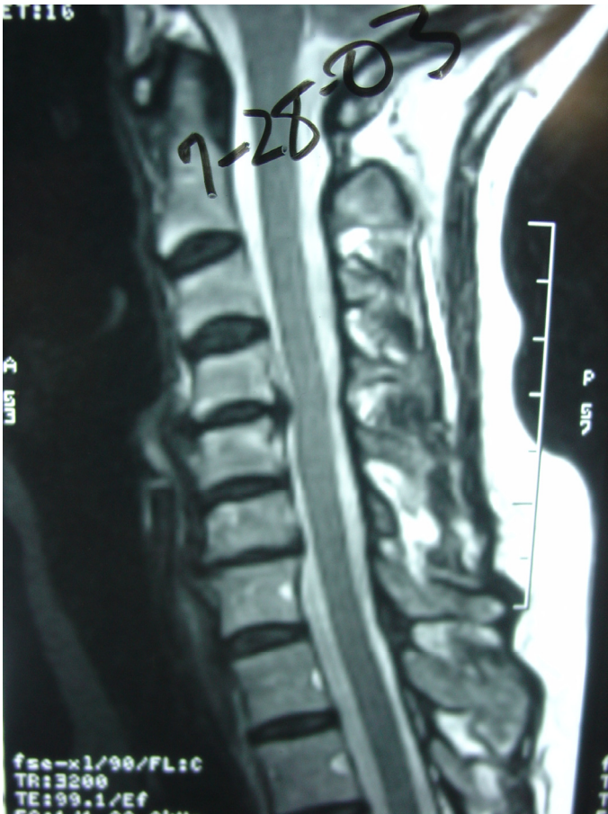
Figure 3: this MRI is ordered due to persistent right arm pain and now shows that the C4-5 disc is herniated to contact the anterior thecal sac.