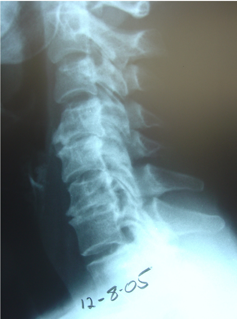
Figure 5: Now two years after the appearance of the C4-5 disc herniation, note the degeneration of the C4-5 disc with retrolisthesis subluxation. The C6-7 disc degeneration that was noted in the 2001 study, four years previous, is still present. Note the preserved C5-6 disc space.

THIS STUDY DOCUMENTS DISC HERNIATION AND DEGENERATION CEPHALWARD TO THE INITIAL C6-7 DISC DEGENERATION. IN FOUR YEARS, THE C4-5 DISC HAS HERNIATED AND DEGENERATED. INTERESTINGLY, THE C5-6 DISC SPACE IS RELATIVELY SPARED IN THIS PROCESS. IT POINTS OUT THAT THE SEGMENT DIRECTLY ABOVE THE DEGENERATED DISC MAY NOT BE THE NEXT TO BECOME UNSTABLE, HERNIATE, AND DEGENERATE. WHY IS THE C5-6 DISC SPARED AND C4-5 STRESSED TO THE POINT OF HERNIATION AND DEGENERATION?