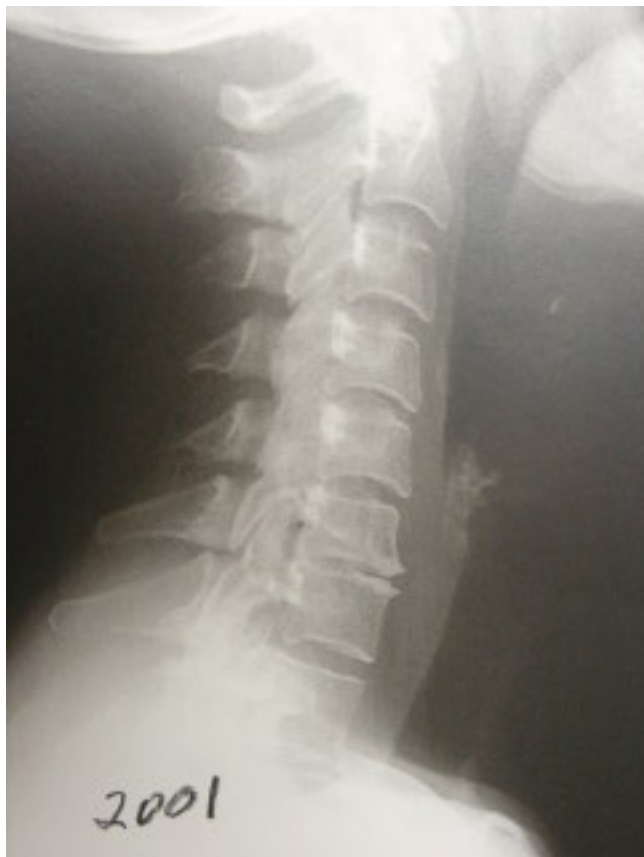
Figure 1: note the degenerative changes at the C6-7 disc level with the loss of physiological sagittal curve and flexion subluxation of C3 on C4. Note the normal appearance of the cephalad and caudad discs to C6-7, especially the C4-5 level. This x-ray was taken in 2001.

Here is shown progressive disc degeneration at the C4-C5 level. It is interesting from a clinical and medicolegal standpoint to observe this phenomenon. Often we are asked the time element of disc degeneration following injury or in this case following disc degeneration at a specific level of the cervical spine.